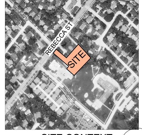
SITE CONTEXT 1:10