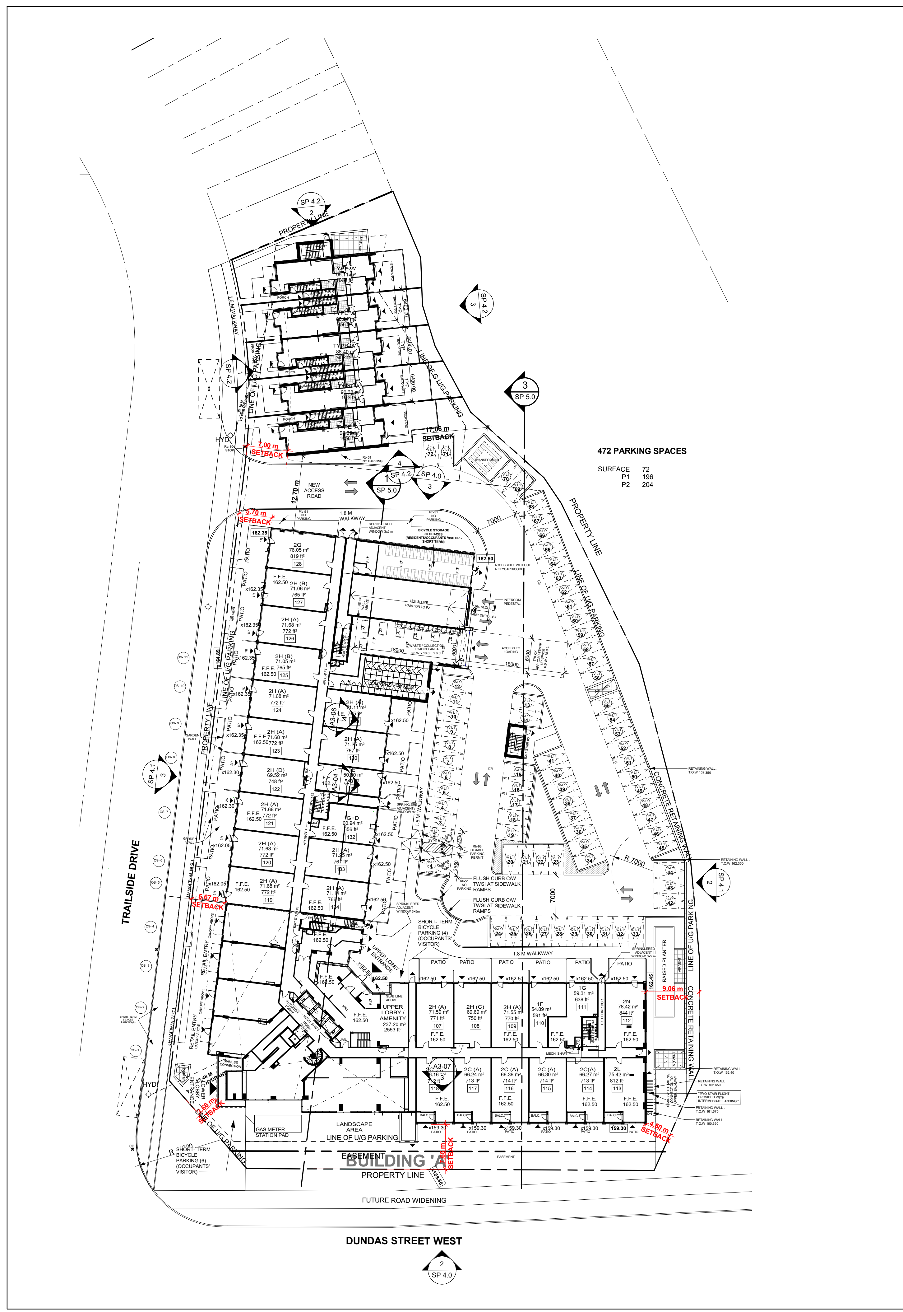
Upper Level 1 Floor Plan 1 Scale: 1 : 400 SP 2.1