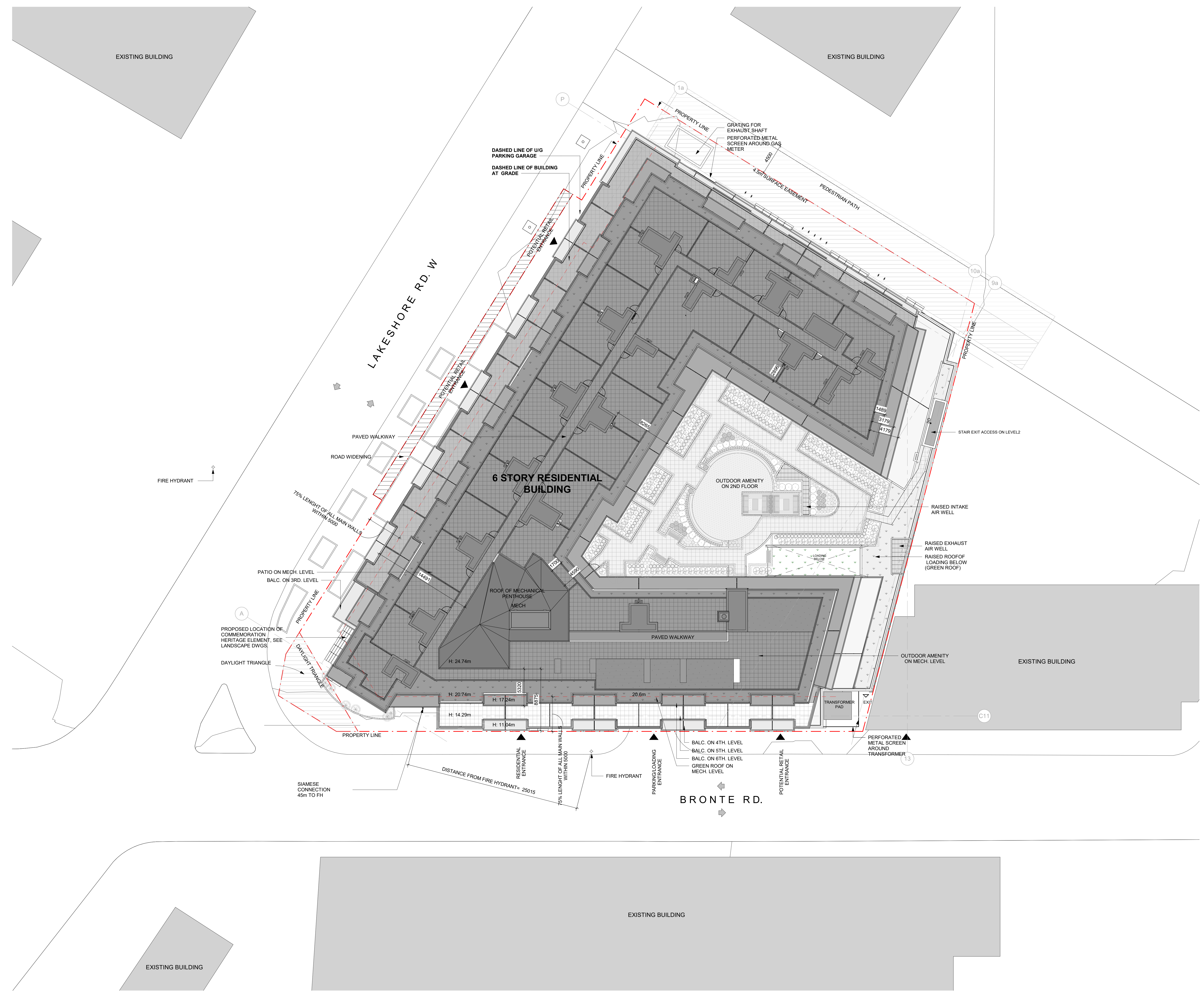
1 SITE PLAN A-0003 / Scale: 1:200