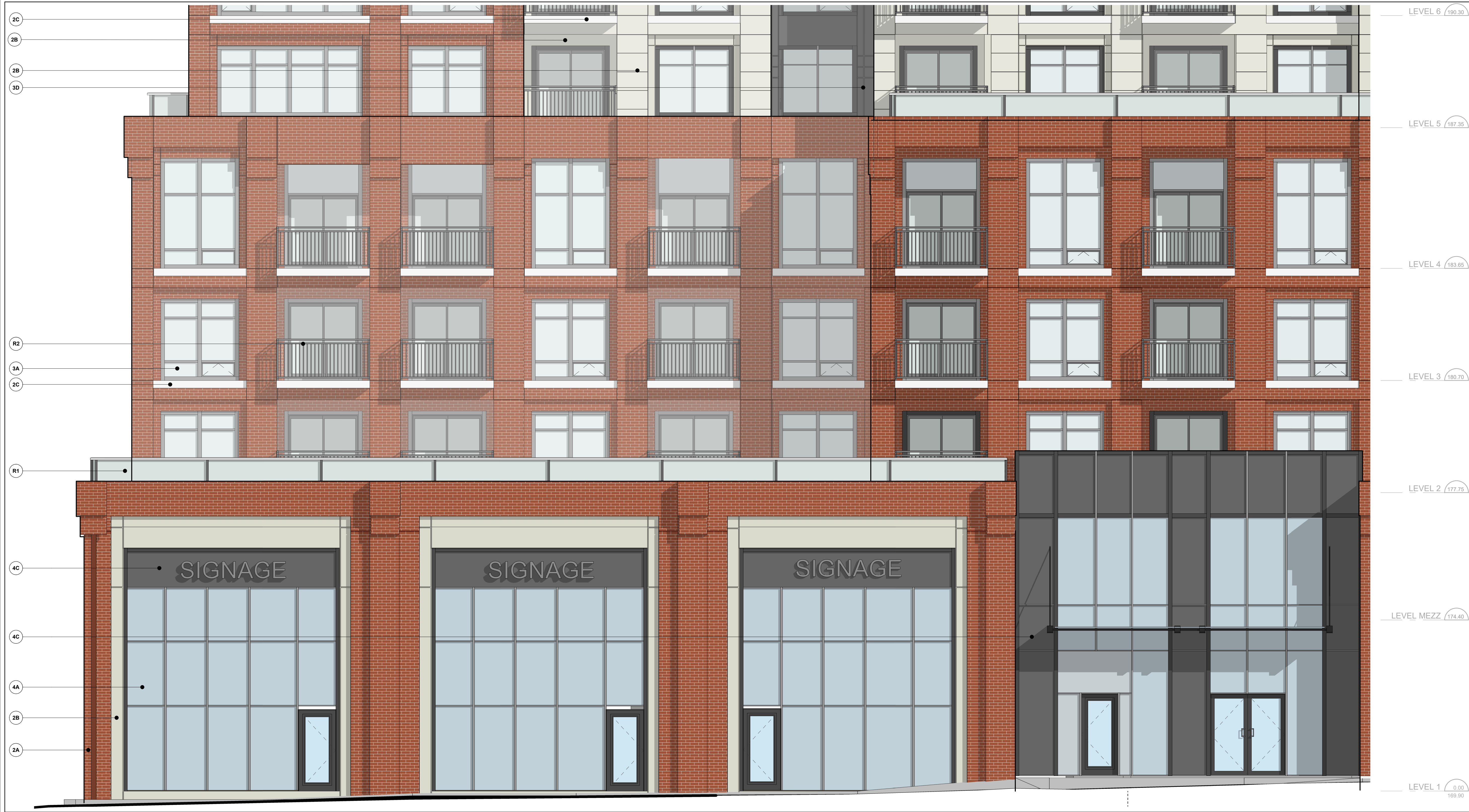
Partial Elevation 2 (East) 1 Scale: 1 : 50 A3.2

All Drawings, Specifications, and Related Documents are the Copyright of the Architect. The Architect retains all rights to control all uses of these documents for the intended issuance/use as identified below. Reproduction of these Documents, without permission from the Architect, is strictly prohibited. The Authorities Having Jurisdiction are permitted to use, distribute, and reproduce these drawings for the intended issuance as noted and dated below, however the extended permission to the Authorities Having Jurisdiction in no way releases or limits the Copyright of the Architect, or control of use of these documents by the Architect.