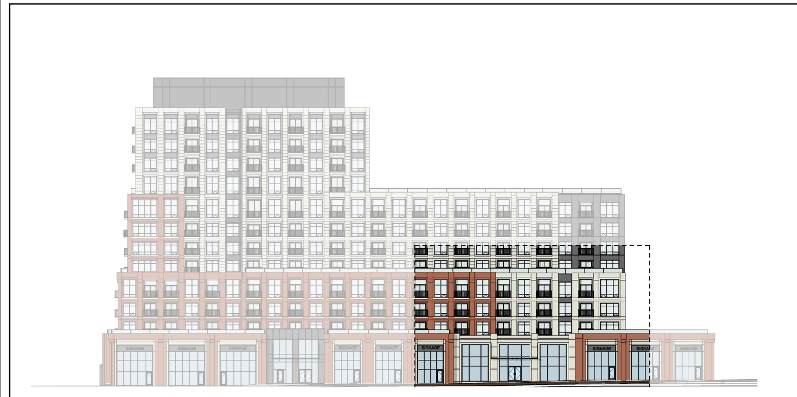
Key Elevation 2 NTS A3.3