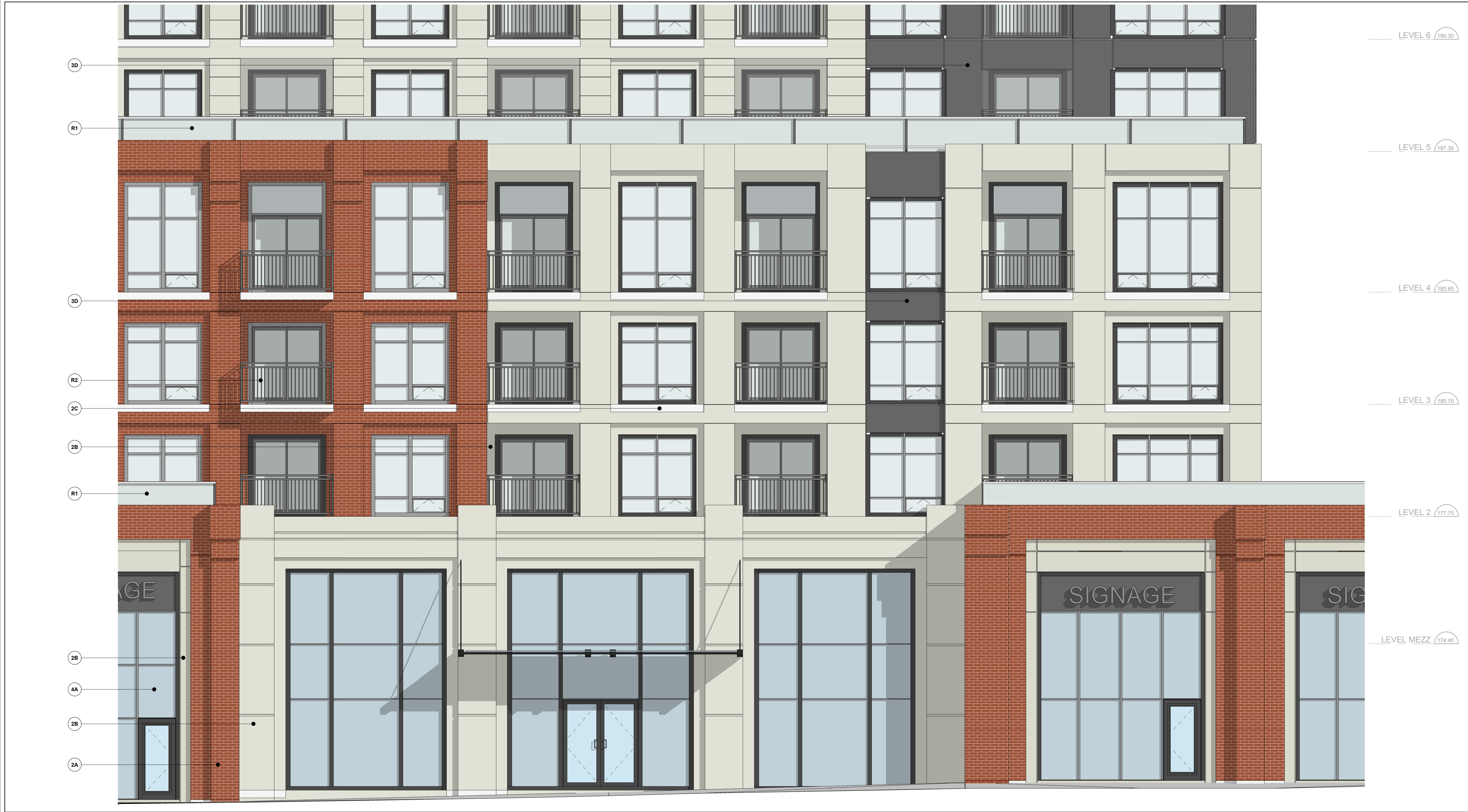
Partial Elevation (East) 1 Scale: 1 : 50 A3.3

All Drawings, Specifications, and Related Documents are the Copyright of the Architect. The Architect retains all rights to control all uses of these documents for the intended issuance/use as identified below. Reproduction of these Documents, without permission from the Architect, is strictly prohibited. The Authorities Having Jurisdiction are permitted to use, distribute, and reproduce these drawings for the intended issuance as noted and dated below, however the extended permission to the Authorities Having Jurisdiction in no way releases or limits the Copyright of the Architect, or control of use of these documents by the Architect.