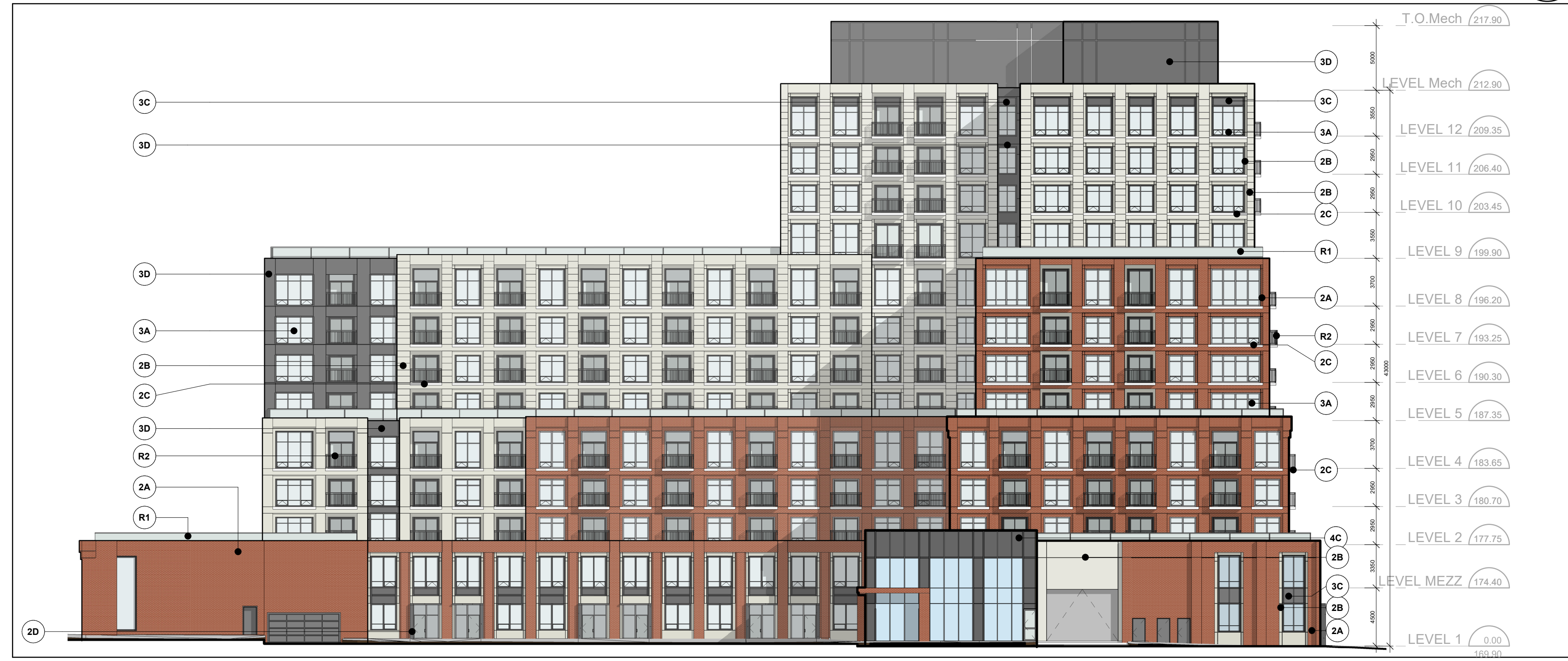
Elevation - West 4 Scale: 1 : 250 A3.1

All Drawings, Specifications, and Related Documents are the Copyright of the Architect. The Architect retains all rights to control all uses of these documents for the intended issuance/use as identified below. Reproduction of these Documents, without permission from the Architect, is strictly prohibited. The Authorities Having Jurisdiction are permitted to use, distribute, and reproduce these drawings for the intended issuance as noted and dated below, however the extended permission to the Authorities Having Jurisdiction in no way releases or limits the Copyright of the Architect, or control of use of these documents by the Architect.