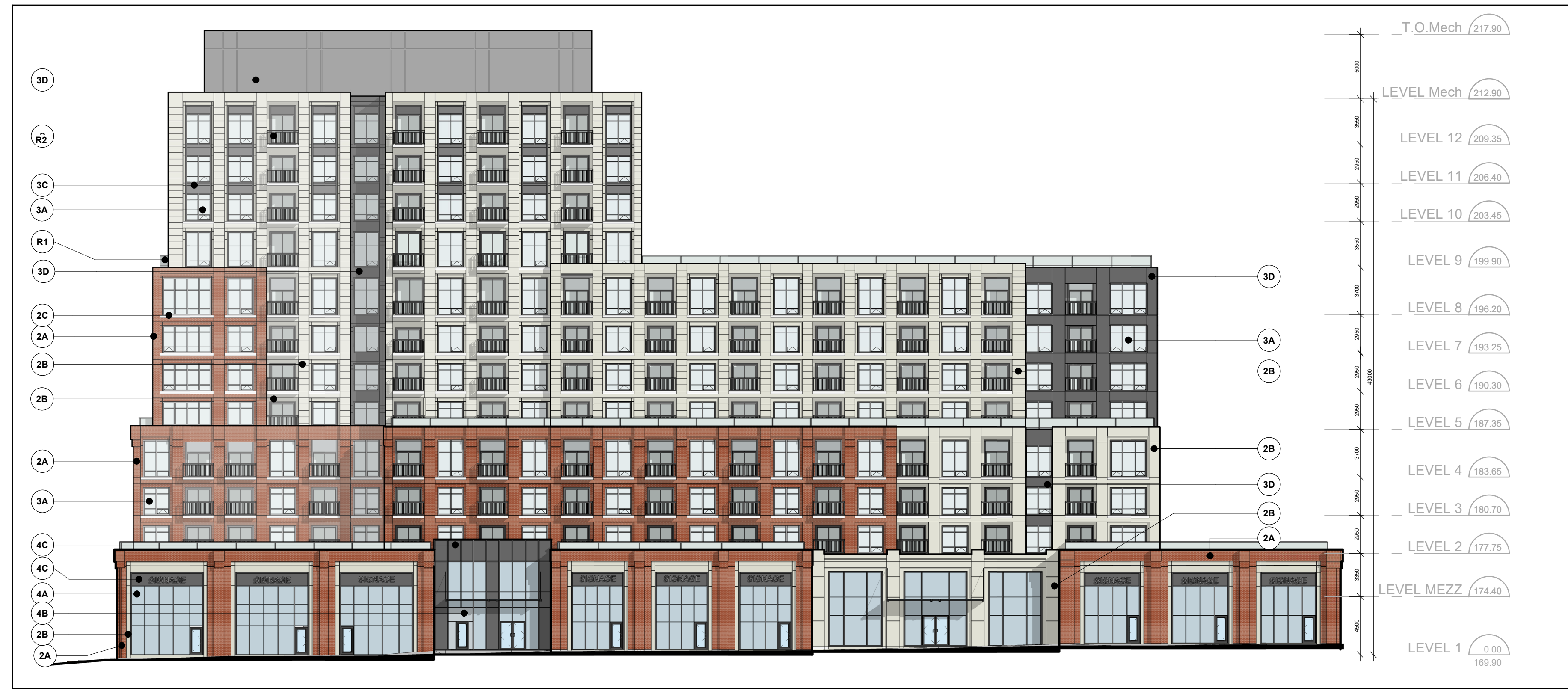
Elevation - East 2 Scale: 1 : 250 A3.1