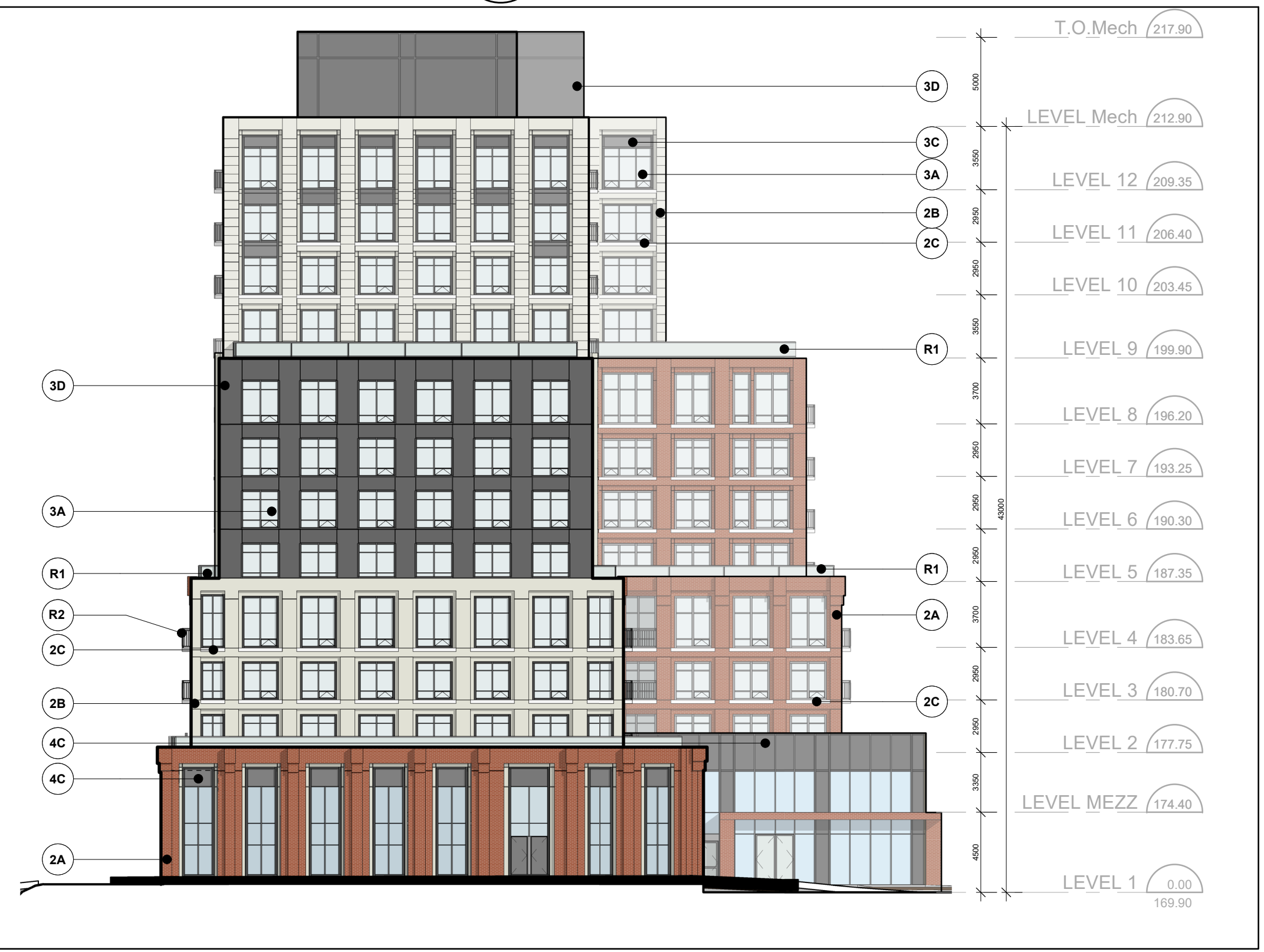
Elevation - North 1 Scale: 1 : 250 A3.1