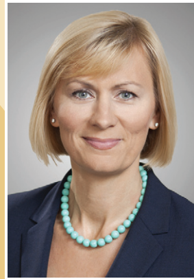
Town Councillor - Ward 6