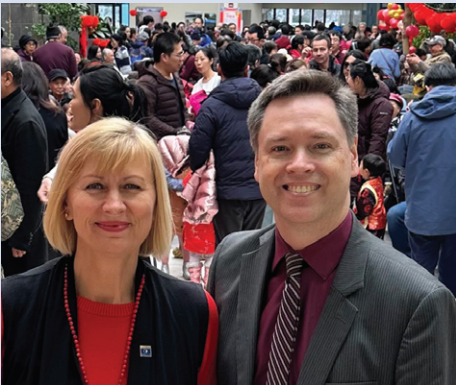
Chinese New Year at Town Hall