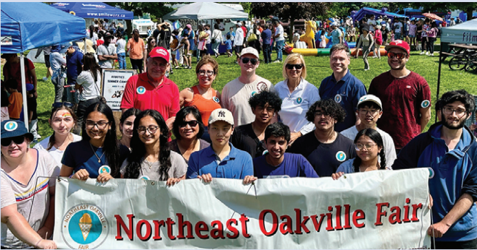
Enjoying the Northeast Oakville Fair