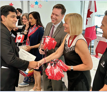
Celebrating new citizens at Iroquois Ridge Community Centre