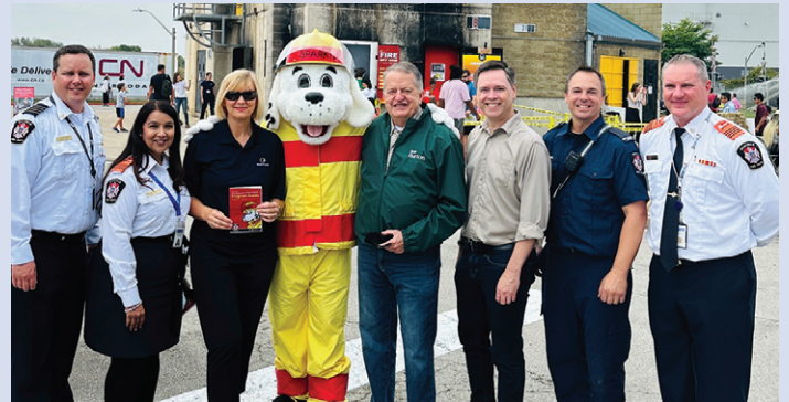
Kicking off Fire Prevention Week