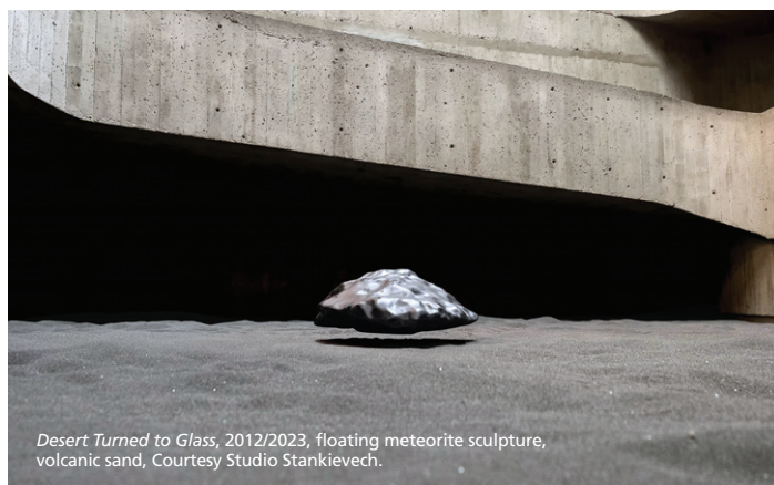
Desert Turned to Glass, 2012/2023, floating meteorite sculpture, volcanic sand, Courtesy Studio Stankieveh.

The Gairloch Gardens gallery features new photographs, sculptures, and a video work based on the artist's recordings of the total eclipse on April 8, 2024. These pieces interact with the lakeside setting, the garden, and the natural light at Gairloch Gardens.