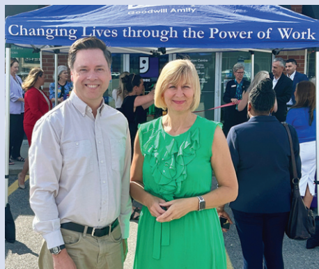
Welcoming the new Goodwill Amity Donation Centre