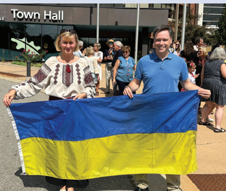
Recognizing Ukrainian Independence Day