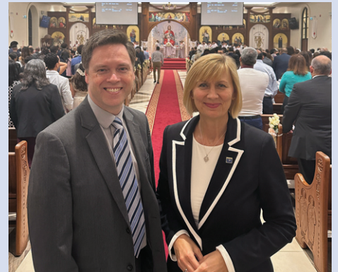
Observing Easter at St. Peter and St. Paul Coptic Orthodox Church