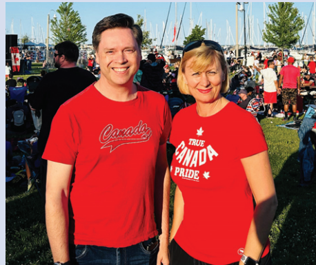
Canada Day in Oakville