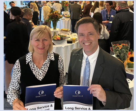
Thanking our long service employees