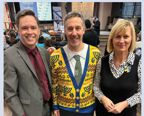
Hanukkah in Oakville