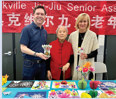
Supporting Oakville Jiu-Jiu Seniors Association