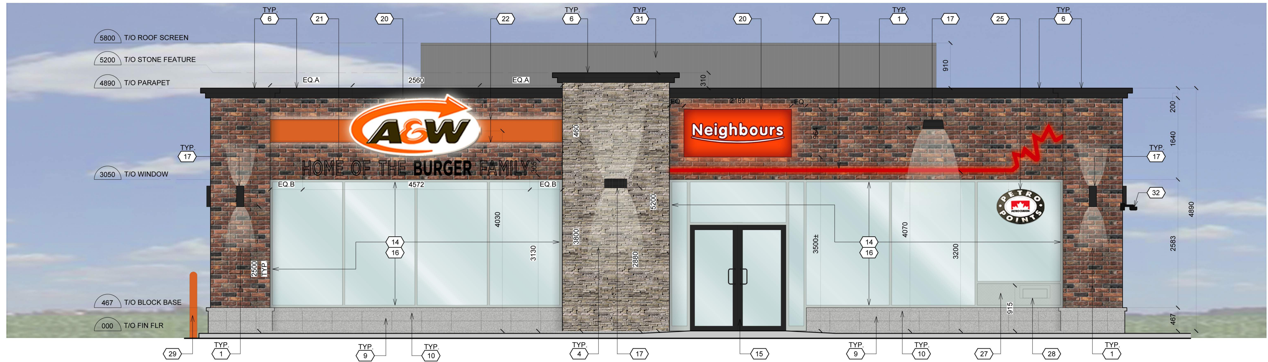
1 SOUTH ELEVATION