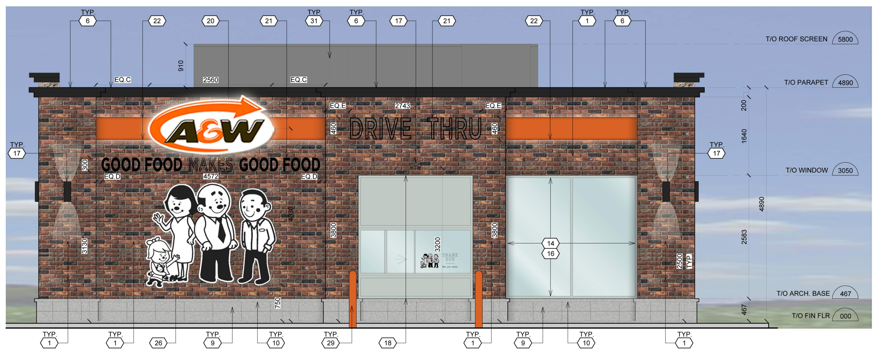
4 WEST ELEVATION